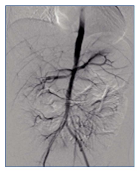
Figure 2. Abdominal arteriography. Abdominal arteriogram showing irregularity of the middle-aortic segment and progressive distal thinning of the aorta in addition to ostial stenosis of the right renal artery with poststenotic truncal and/or dysplastic dilation and an absence of the left renal artery due to previous autotransplantation.

The authors declare that they have no conflicts of interest related to the contents of this article.