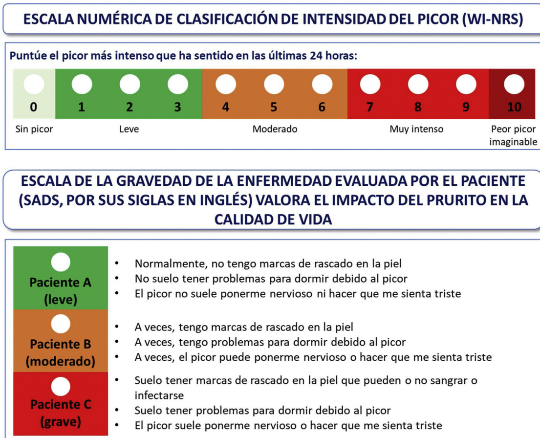
Fig. 3 – Suggested assessment scales for measuring the severity of itching. 14,15