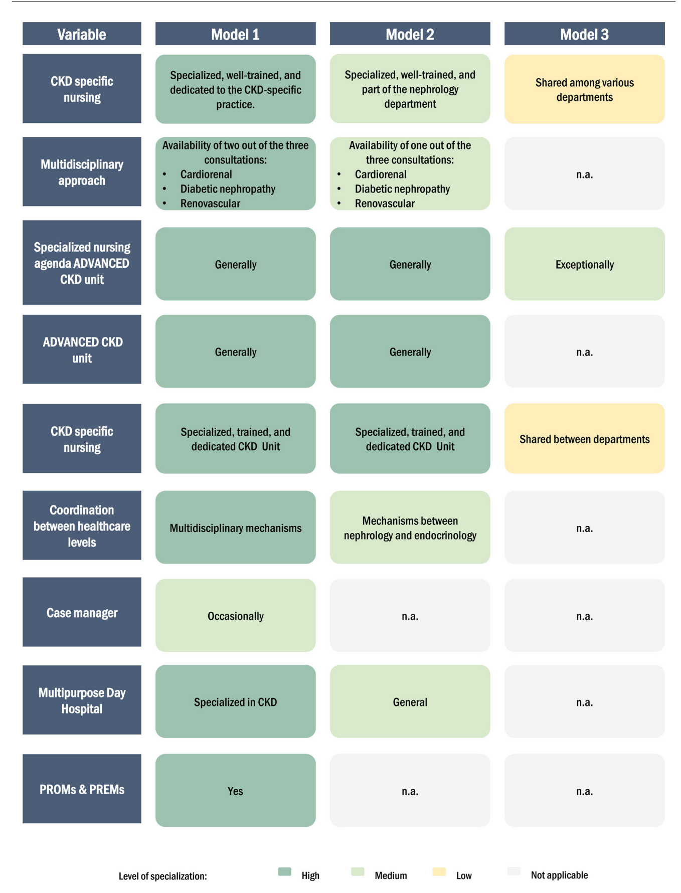
Fig. 2 – Identified models, detailed according to the nine CKD care variables. CKD: chronic kidney disease; NA: not applicable; PREM: patient-reported experiences; PROM: patient-reported outcomes.