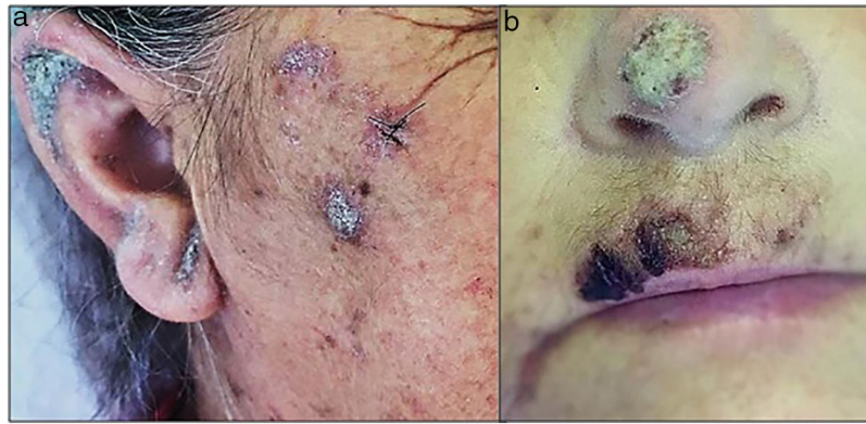
Fig. 1 – Lesions in the face: erythematous-scaly plaques (a and b).

with cellular immunity compromised, including those with graft-versus-host disease, HIV-AIDS, and those ones taking corticosteroids or other immunosuppressants. 1,2 In this particular presentation, mites reproduce more effectively so that affected patients may carry thousands of parasites over the skin surface. It is highly contagious and minimal contact may be enough to lead to infection. Due to impaired cellular immune response, those patients may present atypical manifestations and pruritus may be mild or even absent, so that diagnosis can be challenging. 1-4