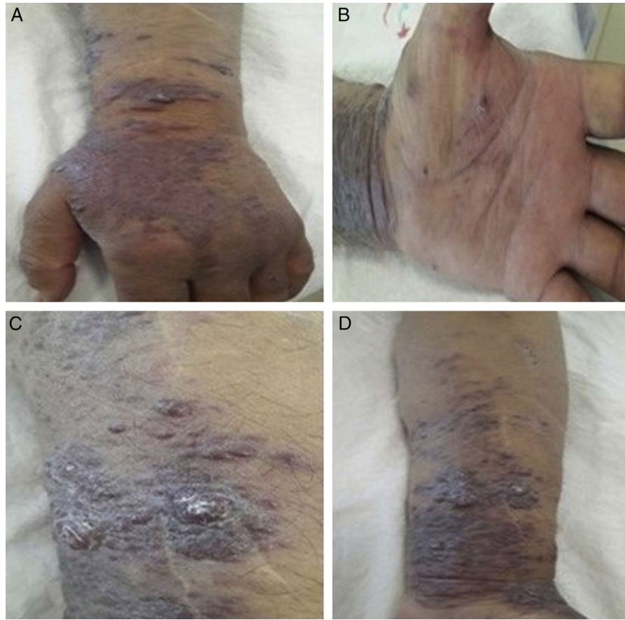
Figure 1 – Multiple discrete, (nonulcerated, erythematous-violaceous nodular and plaques on left forearm and hand(A,B,C,D).