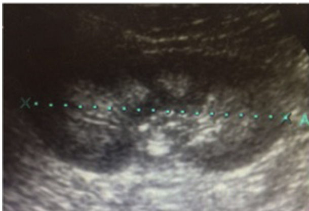
Fig. 1 – Ultrasound image of nephrocalcinosis in case 1.

of asthenia, adynamia and somnolence. The thyroid function test showed thyroid-stimulating hormone (TSH) levels of more than 150 mU/l, T3 levels of 0.19 ng/ml and undetectable T4. Blood samples were positive for antithyroglobulin (181.6 IU/ml) and antiperoxidase (373.2 IU/ml) antibodies. Levothyroxine was started, and the patient's weight and height improved. Now, at 11 years of age, her weight is 29 kg (p8%) and her height 133 cm (p6%); urinary acidification defect persists (maximum urinary pCO 2 of 49 mmHg).