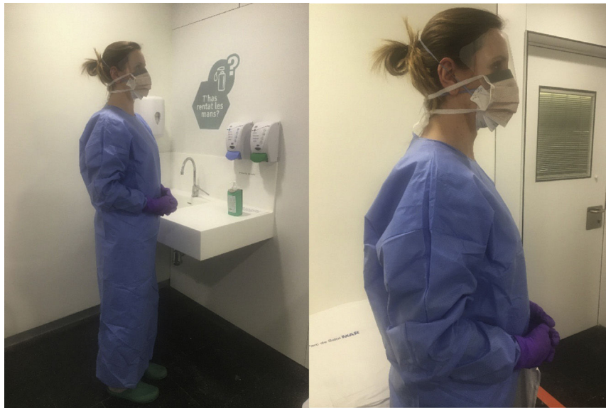
Fig. 2 – Personal protective equipment (PPE), consisting of a pair of powder-free long-sleeved nitrile gloves, a long waterproof gown, a FFP2 mask, and a full-screen surgical mask. This list of individual protective equipment is under permanent review depending on the evolution and new information available on SARS-CoV-2 disease.