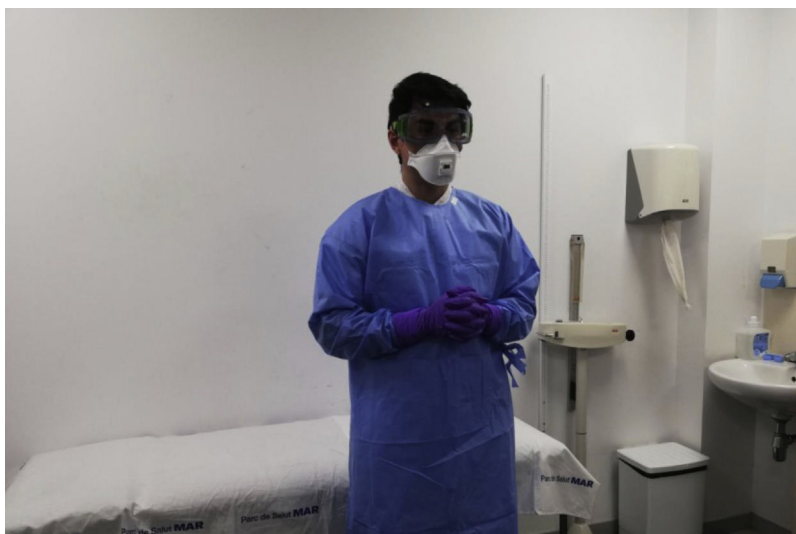
Fig. 3 – If aerosols are to be produced (administration of nebulisations, mechanical ventilation, fiberoptic bronchoscopy, orotracheal intubation, aspiration of secretions, etc.), a FFP3 mask (with exhalation valve) and full protective glasses are required. It is recommended that all material be disposable. If long sleeves are not available, use the isolation gown (green) and add a plastic apron.