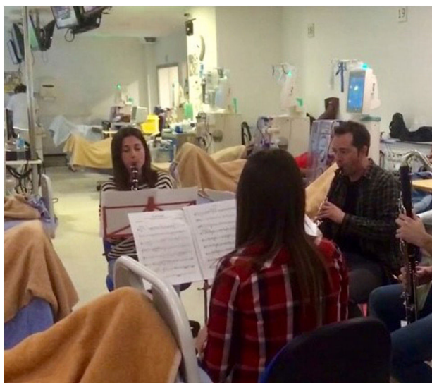
Fig. 1 – Images of the performances.

A total of 120 patients were selected for the study, 92 agreed to participate and the sample was finally reduced to 90; one patient died and was eliminated and the other was transferred to another hospital. The clinical and demographic