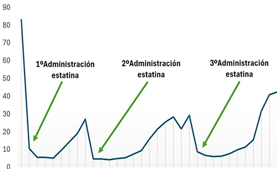
Fig. 2 – Evolution of glomerular filtration rate expressed by CKD-EPI formula (ml/min) associated with the moments of administration of the statin, observing a decrease in glomerular filtration rate coinciding with the administration of such drug.

initiation of the drug and the clinical manifestations can be variable.