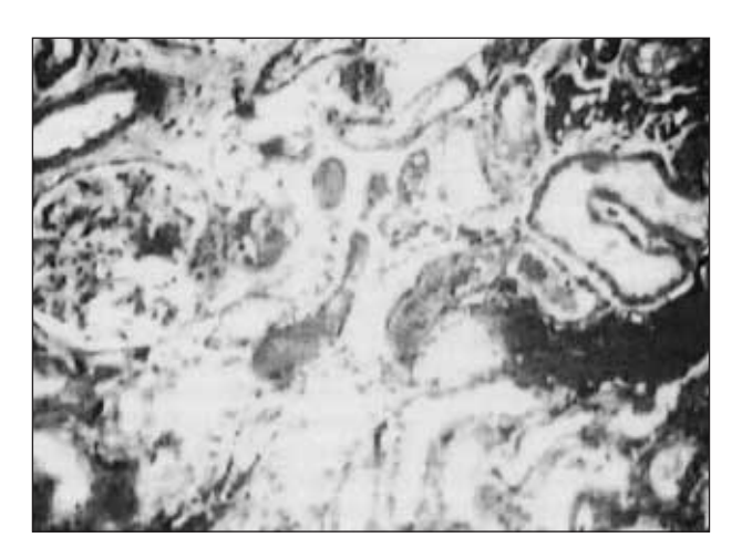
Fig. 2.—Microphotography showing glomerular lesion with microthrombi within the tubular lumen.