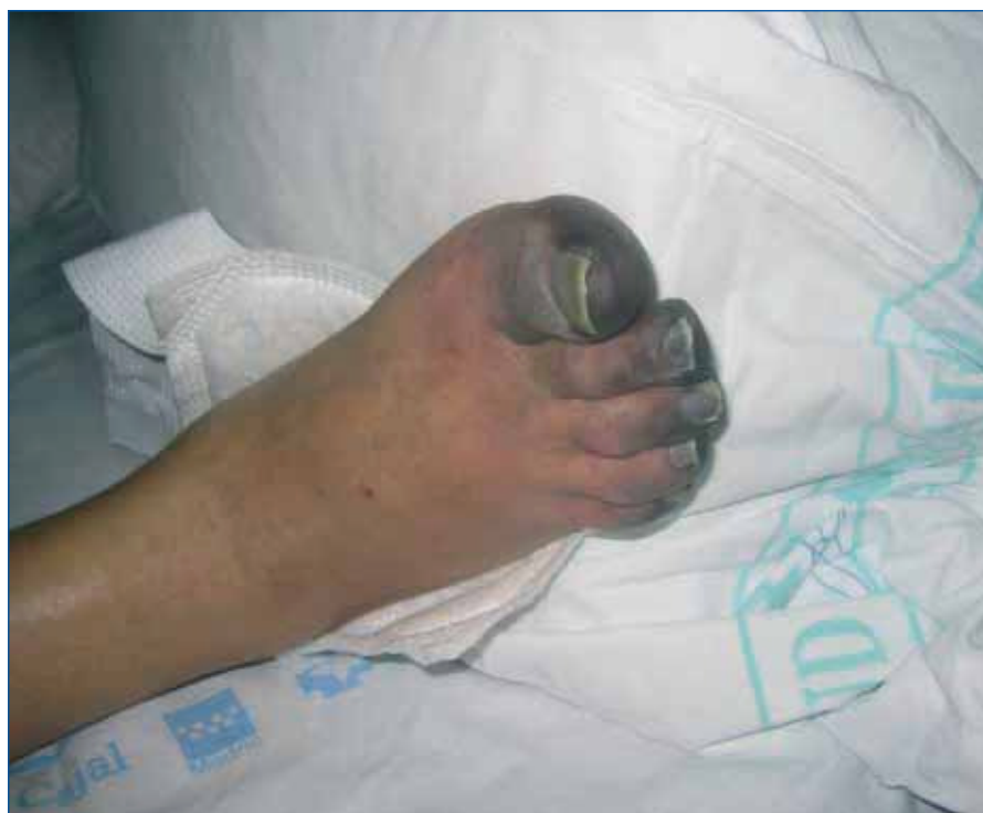
Figure 1. Distal cyanosis affecting toes resulting from microvascular thromboses.

A 72-year-old male patient who experienced an acute myocardial infarction