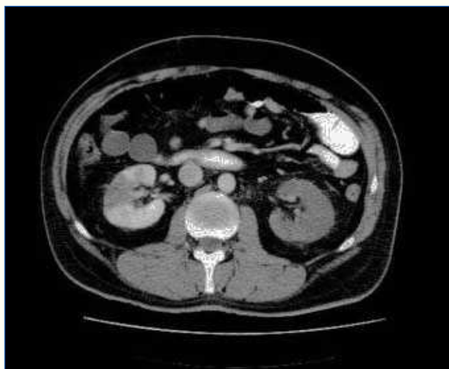
Figure 2. Selective renal arteriography. Multiple filling defects in the left renal artery due to thrombosis. Right renal artery is patent, with minimum peripheral defects.

associated to cocaine use is increasing, and we should remember that the kidney is one of the target organs affected. Studies should be conducted to elucidate the mechanisms of renal damage. The possibility of renal damage associated to cocaine should be suspected when faced with kidney disease of uncertain etiology in a patient with difficult to control HBP, renal infarction without other risk factors, or rhabdomyolysis from an unknown cause. This patient had elevated LDH and liver enzymes, but CPK levels remained at all times within the normal range, thus ruling out the presence of rhabdomyolysis. It should not be forgotten that cocaine addicts require multisystemic vigilance and that no specific cocaine antidote is currently available, so that the only effective tool is prevention.