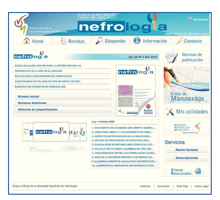
Figure 1. Front page of the NEFROLOGIA website.