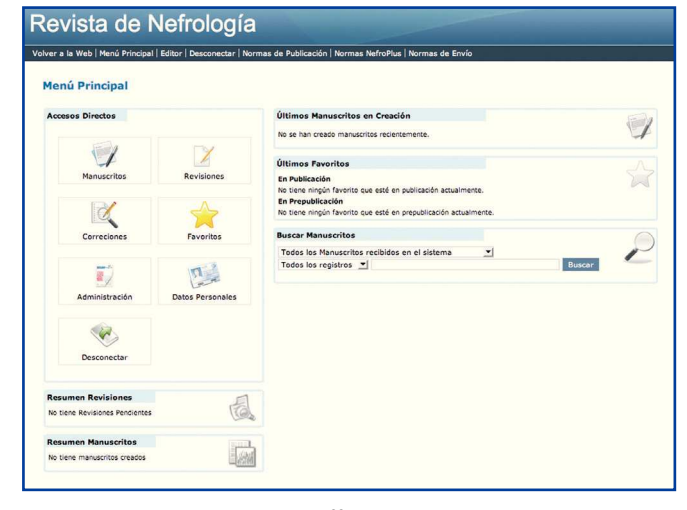
Figure 2. Individual utilities offered by the website to registered users.

The website platform is aimed at management by article, not by journal issue, so that, after approval of each original, its corresponding DOI is created automatically and the process of editing, layout and indexing in PubMed are initiated, which allows it to be included in the website and on PubMed as an article in prepublication one or two months in advance