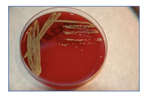
Figure 1. Oerskovia culture on a blood agar plate

The peritoneal fluids were collected in aerobic and anaerobic bottles for BacT/Alert blood culture test (bioMérieux, Durham, NC, USA). Both bottles were found to be positive at between 23 and 24 hours, and the gram staining revealed branching gram-positive bacilli. Chocolate agar, blood agar, and colistin-nalidixic acid