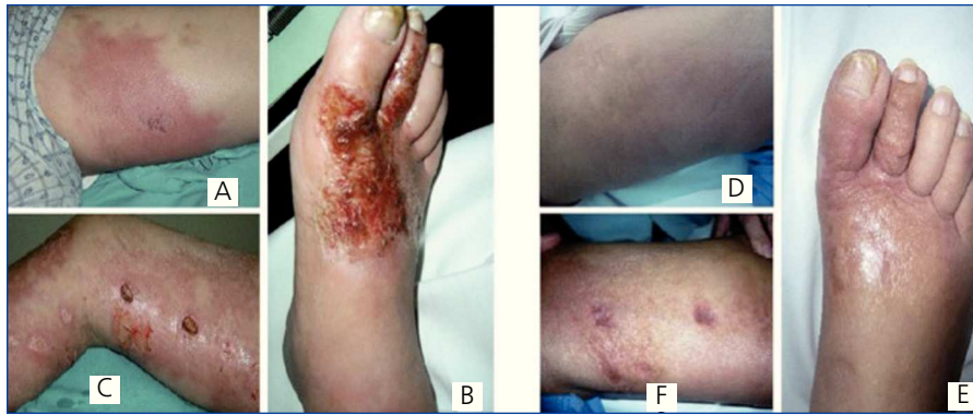
Figure 1. Evolution of lesions.

(A) Erythematous, indurated lesions on the internal face of the left thigh. (B) Desquamation and ulcerated lesions on the dorsal side of the right foot. (C) Ulcerated lesion of the thigh. (D) Reduced indurated erythema. (E and F) Almost complete disappearance of desquamation and ulcerated lesions after 1 month.