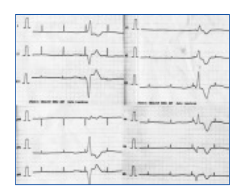
Figure 1. 12-lead electrocardiogram showing the failure of capture (absence of QRS complexes after the first, second and fourth spicules).

In conclusion, the presence of a cardiac pacemaker does not always protect the myocardium from the deleterious effects of hyperkalaemia. Moreover, the device requires a normal electrolyte balance for proper operation. Therefore, heart rate monitoring, which is essential for all symptomatic hyperkalaemia, should not be overlooked in patients with pacemakers. Likewise, the presence of a pacemaker must not be a decisive factor when urgent haemodialysis is indicated for severe hyperkalaemia.