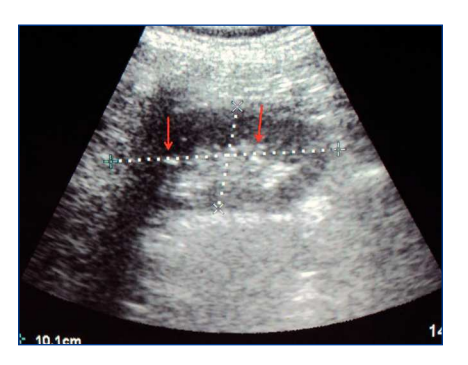
Figure 1. Renal ultrasound with medullary hyperechogenicity suggestive of calcifications.

tibodies, with a titre of 1:2560, positive anti-SSA and anti-SSB. We performed Schirmer's test, which was positive, curiously without dry eye symptoms. In the outpatient follow-up after 16 weeks on 5mg/day of prednisone, the patient had creatinine of 0.88mg/dl and a decreased potassium salt requirement, maintaining normal levels of potassium, urinary pH at around 5, calciuria of 3.9mg/kg/day, negative urinary anion gap (sodium of 21mEq/l, potassium of 8mEq/l, chlorine of 47mEq/l), with the absence of leukocyturia, erythrocyturia and proteinuria.