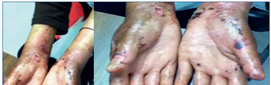
Figure 1. Epidermolysis bullosa dermatological lesions seen on patient with chronic kidney disease on admittance.

Subsequent to cardiac monitoring, monitoring of non-invasive blood pressure and pulse oximetry, intravenous sedation and analgesia